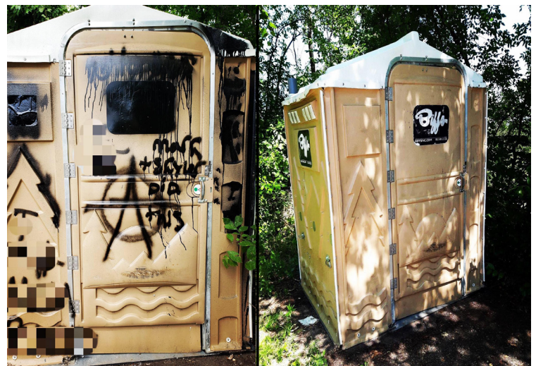
AFTER WIPE OFF

Before and after graffiti removal, a job well done using our very own WIPE OFF! This $2,400 portable restroom covered in black spray paint SAVED by using only three cans of WIPE OFF costing around only $40!